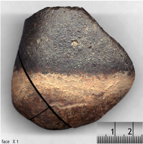
face X 1

classified by Paul P. Sipiera Planetary Studies Foundation USA publication Meteoritical Bulletin N°85