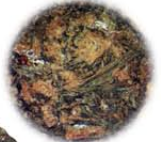
chondrule X 7